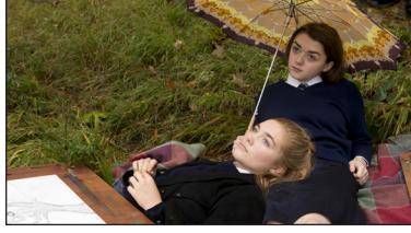
The Falling (CAROL MORLEY, UK)

Hailing from opposite ends of the Earth, two accomplished acrobats work towards the same goal: to use the art form of circus to instill hope in the youth who languish in the impoverished communities the artists once called home. Nimble shuttling us between Nunavut and Guinea, Susan Gray's uplifting documentary invites us to marvel as these men, whose athleticism is only exceeded by their altruism, guide the most marginalized of youth from their first tentative backflips to centre stage at the Vancouver Olympics and Cirque du Soleil.