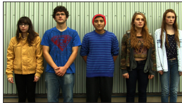
Reel Youth Film Festival

Louie Psihoyos ( The Cove ) returns with another enviro-doc that doubles as a top-flight thriller. Racing against the clock to stave off a mass extinction, Psihoyos' undercover activists infiltrate underground marketplaces trafficking in endangered marine life and immerse us in oceans turning toxic from our energy consumption. The stakes couldn't be higher. The call to action couldn't be more urgent. "A mesmerizing entertainment and enlightenment... A chilling call to action to stop ocean poisoning before it results in destruction of the planet." — Hollywood Reporter