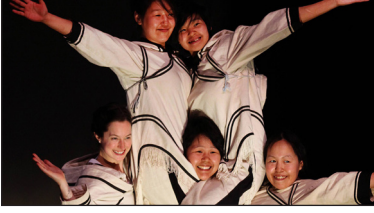
Circus Without Borders: The Story of Artcirq and Kalabante (SUSAN GRAY, USA)