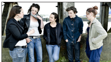
We Did It on a Song

"Chloé Zhao's plaintive first feature is a heartfelt dramatized contemplation of life on the Pine Ridge Indian Reservation in South Dakota, experienced partly through the eyes of a 13-year-old girl... [The] project clearly was made with profound respect for its subjects, from families ravaged by alcoholism to daredevil young bull-riders to those who cling through tough times to their belief in community." — Hollywood Reporter