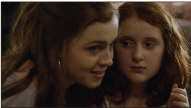
My Skinny Sister